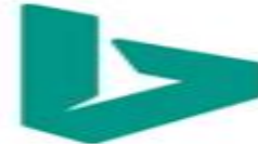
Bing Image Creator