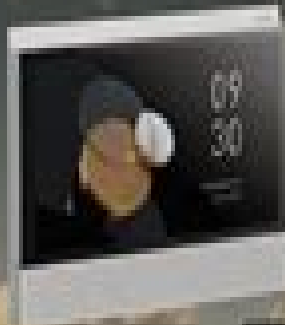
Panel Hub S1 Plus US