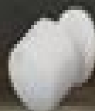
Presence Sensor FP300