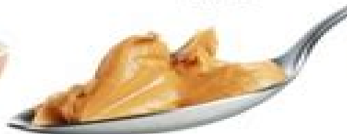
peanut butter 1 tbsp