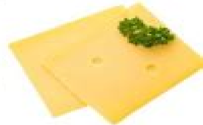
Cheese Slice 1 count