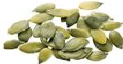
Pumpkin Seeds 1 TSP