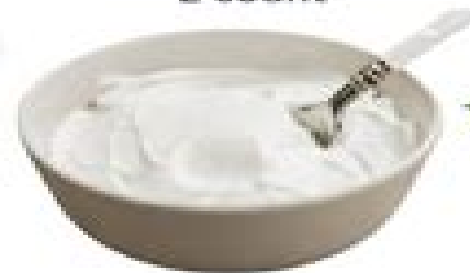
Greek Yogurt 1 cup