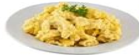
Scrambled Eggs 2 count