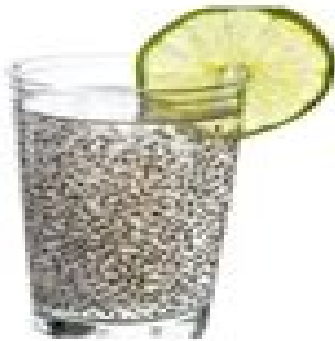
Chia Seeds Water