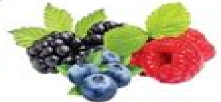
Berries 1/2 cup