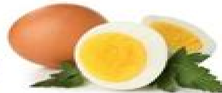
Boiled Eggs 2 count