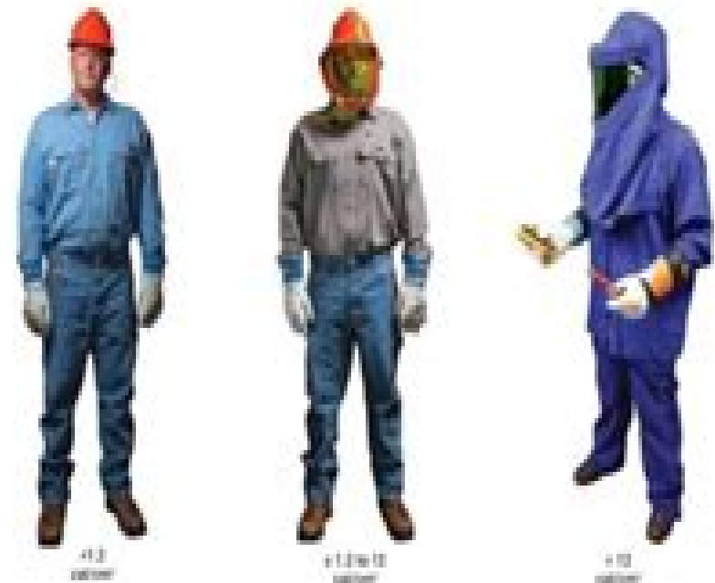
Energy Level Incident Energy

*This table is for use only when an incident energy analysis has been completed. If incident energy exposure has not been determined, refer to NFPA 70E, 2024 Edition for PPE Category Method.