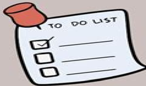
top priority to do list