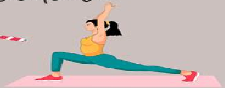
10 minute stretch