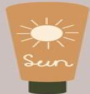
go out for fresh air