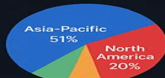
TikTok User Distribution by Region (2025)