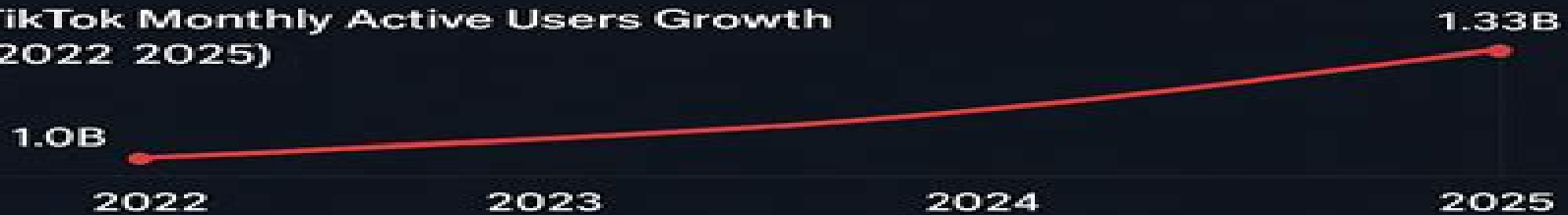
TikTok Monthly Active Users Growth (2022-2025)