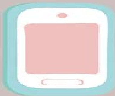
go screen free for 30 minutes