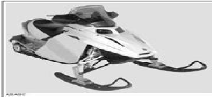
TYPICAL — REV SERIES